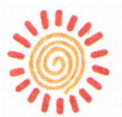
Junction Community Centre