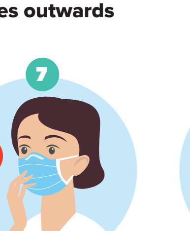
Avoid touching face