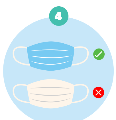
Ensure colour side faces outwards