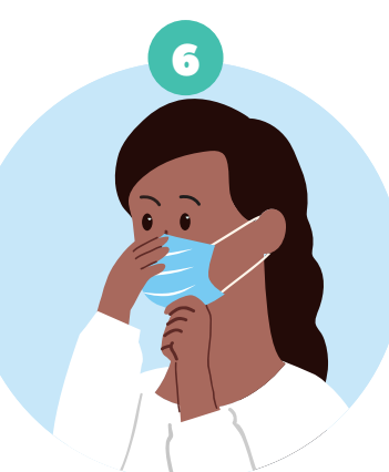
Ensure mouth, nose and chin are covered

Dispose of mask directly after use - don't place on surfaces