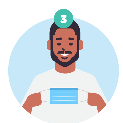
Find top side , where metal or stiff edge is